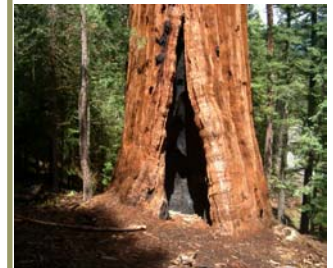
Example of Sequoia trunk picture

If you are interested in adopting a Sequoia for yourself or a loved one, call Valerie at 866-KEEP-TREES (533-7873) or fill out the form above and mail it to the Sequoia ForestKeeper office with payment.