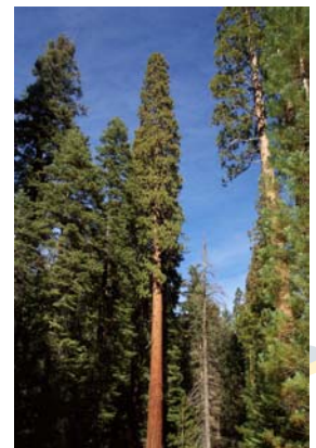
Example of Sequoia top picture

Giant Sequoias are the world's largest living things. These majestic trees can easily grow to over 300 feet with diameters approaching 40 feet. They weigh up to 600 tons.